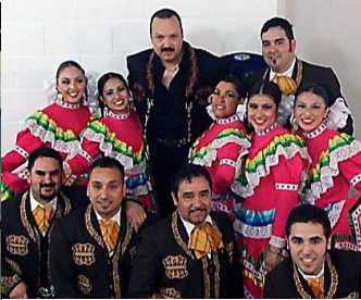
Calabaceado With PEPE AGUILAR at Miami 2007 Premio lo Nuestro Awards Click link or copy and paste

https://video.search.yahoo.com/yhs/search:_ylt=A0LEVjMiiGhXoOUALXAPxQt:_ylu=X3oDMTByMjB0aG5zBGNvbG8DyMxYxYwNzYw--?p=Premio+Lo+Nuestro+XIX+Pepe+Aguilar&fr=yhs-att_001&hspar=att&hsimp=yhs-att_001#id=11&vid=2f6933aca016dc03e0f0782ae78a89d2&action=view