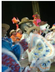
Carnaval en Mazatlan at Harris Theater

http://www.bing.com/videos/search?q=Pepe+Aguilar+2008&&view=detail&mid=50D5C1236E32E3363FC950D5C1236E32E3363FC9&rvid=50D5C1236E32E3363FC950D5C1236E32E3363FC9&fsscr=0&FORM=VDFSRV Slide to 2:15 minute mark.