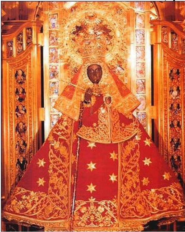
The true Santa Maria de Guadalupe in the town of Guadalupe in Province of Caceres in Extremadura, Spain

The Spanish Guadalupe is a wood carving said to have been created by St. Luke. Other accounts place its origin at about the 6th century. I could not find supporting information either way and I have not found what her name was at that time. It is dressed in rich brocade cloaks. Other than her dark skin it is not at all like the Tepeyac image in Mexico City. The Mary of Cáceres statue (as stated I could not find what she was named at that time), carries the Child Jesus in her left arm, holds a royal crystal scepter in her right and wears a gold crown on her head.